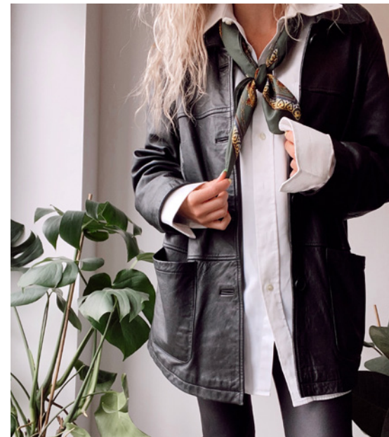
@Needs_nothing_new wearing a skirt she purchased at her local Salvation Army Shop

"I've shopped secondhand for as long as I can remember- the best finds for me have already had a life. By using charity shops I've been able to put together a wardrobe of unique finds that I love and that are much better quality than I could ever afford new. My style isn't directed by what's going on in high street stores and feels much more creative- it also means my wardrobe won't go out of fashion- it's sustainable in every way. I also love the feeling of finding a bit of treasure in charity shops."