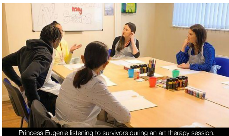
Princess Eugenie listening to survivors during an art therapy session.

https://www.salvationarmy.org.uk/news/royal-touch-art-therapy-survivors-modern-slavery